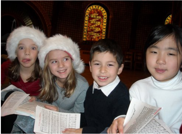
The cherubic faces of FBCN children are filled with the joy, wonder and fun of Christmas!