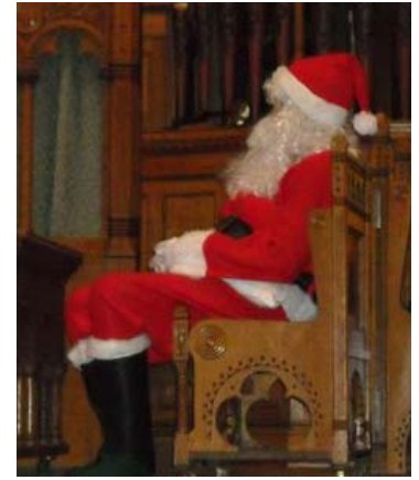
Despite his hectic Christmas Eve schedule, even Santa found time to worship at FBCN!