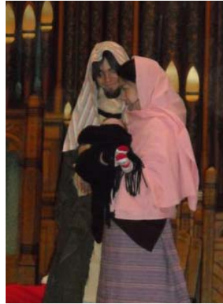
Cradled in the arms of "Mary and Joseph," the star of the pageant arrives.